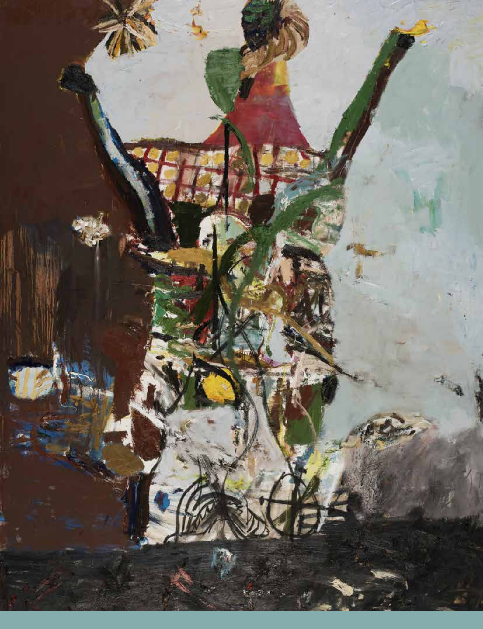
JAMES DRINKWATER: the sea calls me by name 1 June - 11 August 2019